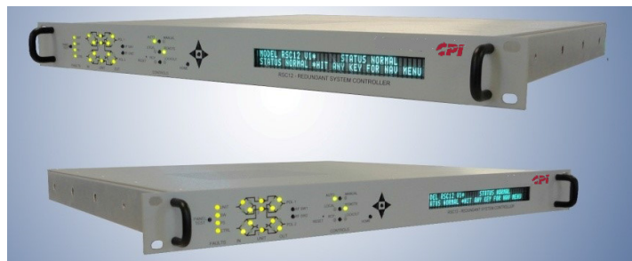
1:2 Redundant System Controller, Model RSC12V1-AC

The RSC offers monitoring and control of auxiliary RF hardware; remote monitor and control via network, serial interface, or parallel I/O; flexible configuration of the system behavior; remote disable of local controls for security; and the ability to detect and report certain failures within the controller itself.